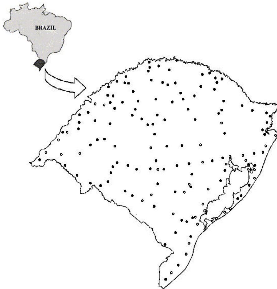
Figure 1: Wetlands sampled and distribution of aquatic pteridophytes in wetlands of the State of Rio Grande do Sul. ● sampled areas ○ presence of aquatic pteridophytes.

The diversity of aquatic pteridophytes corresponds to the number of collected species in each sampled area. Samples which were deposited in herbaria and previously published studies were not taken into consideration in the analysis of the diversity and distribution of the species. Wetland localization was determined using Global Position System (Personal Navigator, model GPS III Plus). The frequency of species occurrence was classified as constant (100%), frequent (99-50%), sporadic (49-10%) and occasional (9-1%) (Ávila, 2002). Linear regression was used to analyze the correlation between pteridophytes richness and wetland area, and altitude.